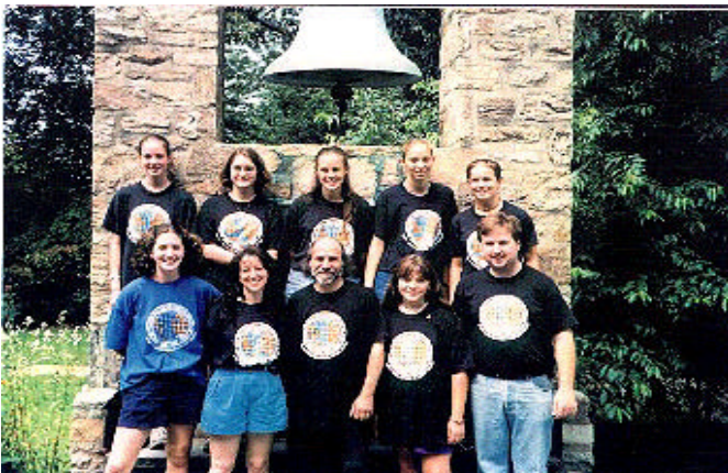
The 3rd Summer Music camp at Camp Wightman