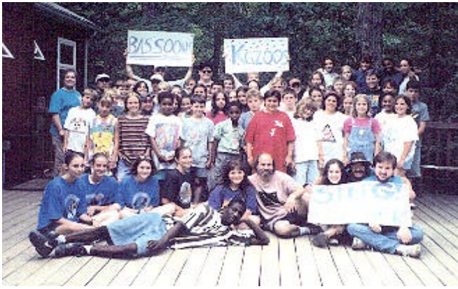
Summer Music Camp at Camp Wightman

You can E-mail us at wdpsons@aol.com . We're always happy to hear from you and we always write back.